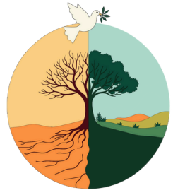
Garden of Peace Isaiah 32:14-18